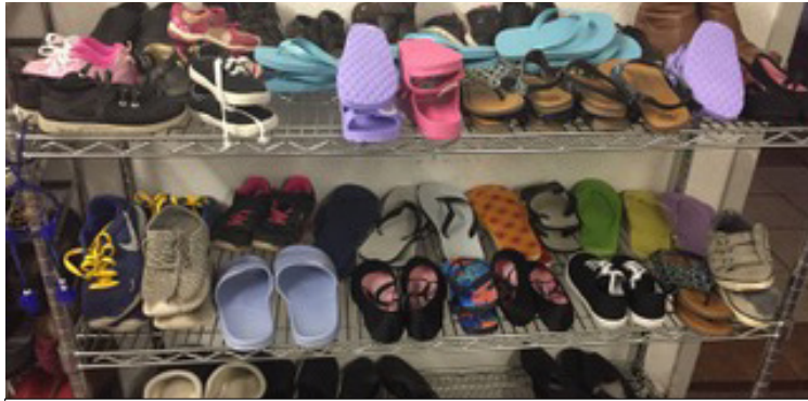
Shoes donated for those who may need them when they arrive.