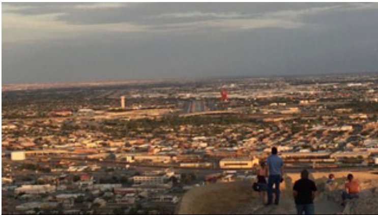
A scenic view of Ciudad Juarez across the border.