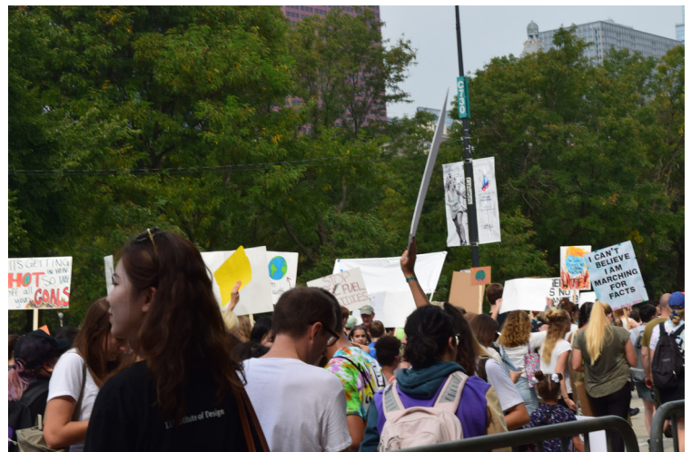
Many gather in Downtown Chicago, IL in support of climate change.

We walked - filling the streets - from Grant Park to the Federal Plaza. There were so many that we could not enter into the Federal Plaza. So many of us just remained on the street shouting slogans. There were a number of speakers but the crowd was so large we could not hear them.